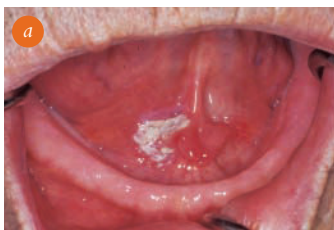
(a) white patches of the oral tissues – leukoplakia