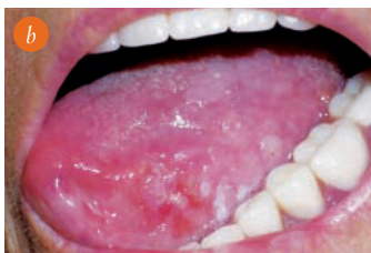
(b) red and white patches – erythroleukoplakia