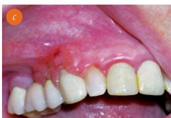
(c) and (d) an abnormal lump or thickening of the tissues of the mouth.