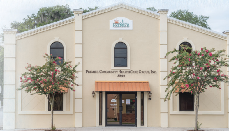
Premier Administration Building