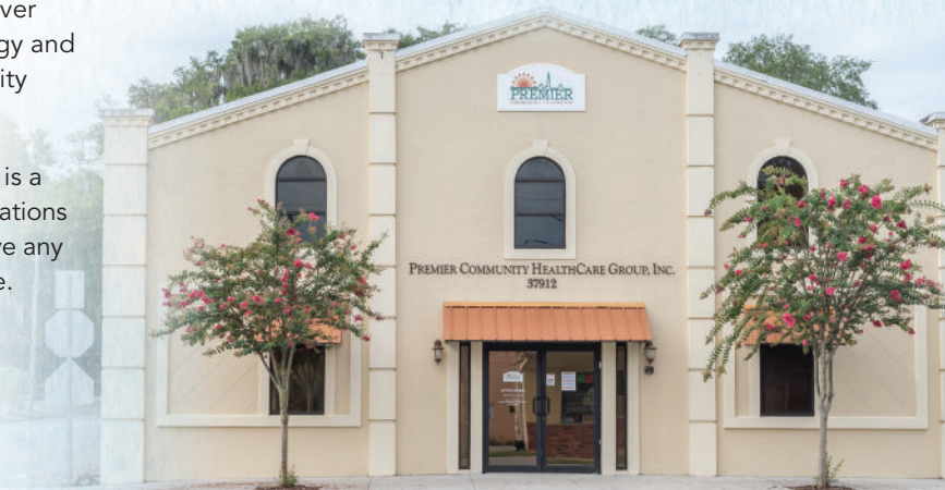
Premier Administration Building