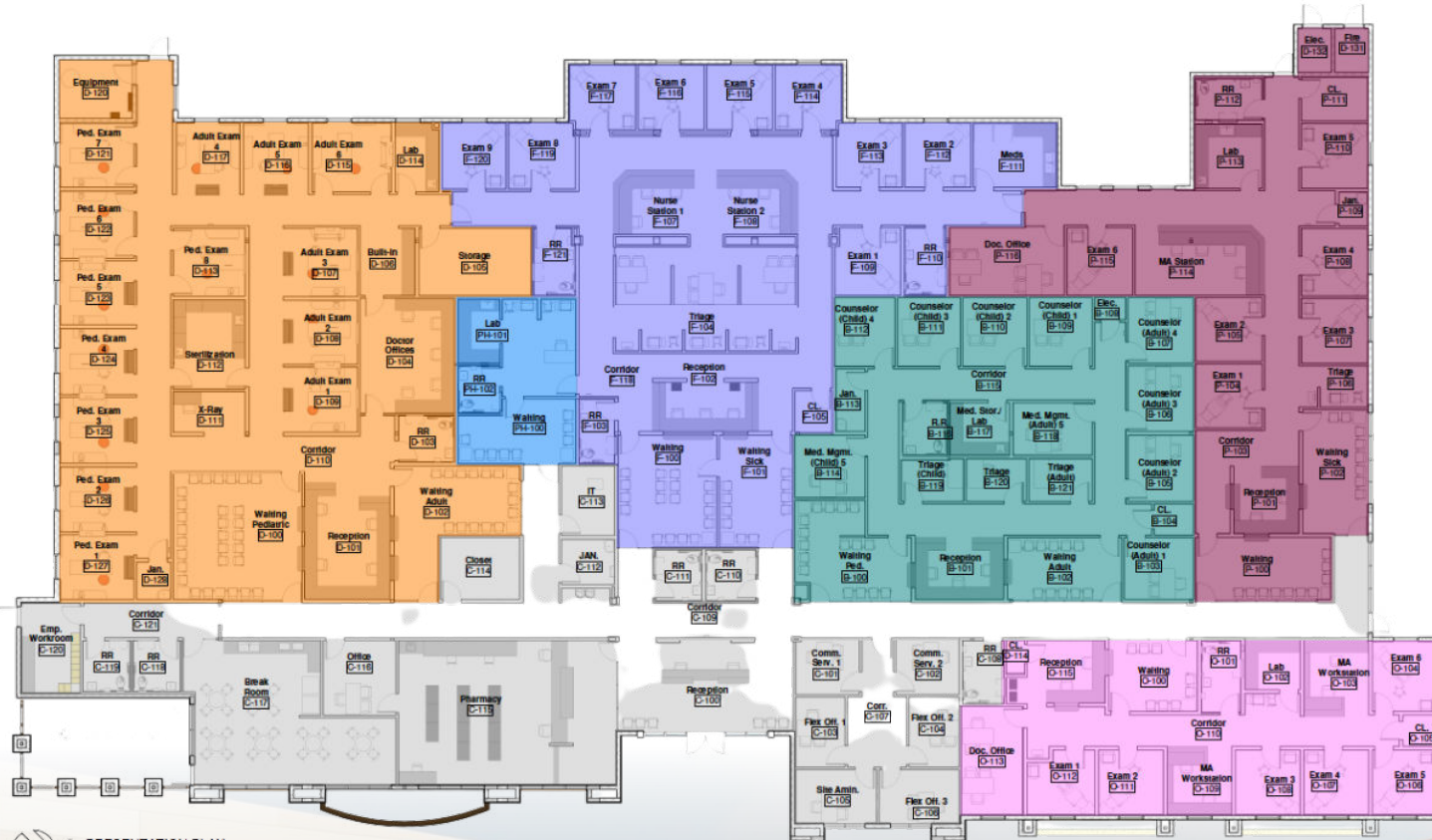
PRESENTATION PLAN 1/8" = 1'-0"