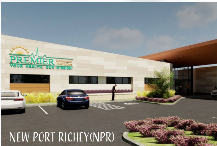
NEW PORT RICHEY(NPR)