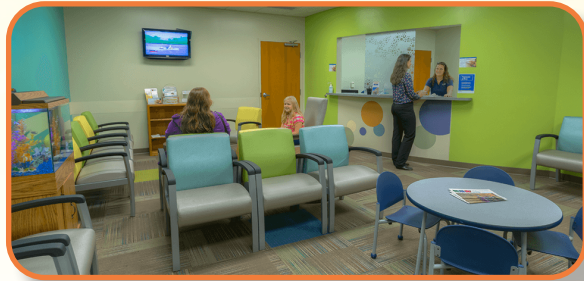
Stock images are representing potential décor themes.